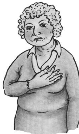
In your heart