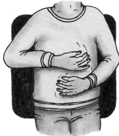
Your tummy feels funny