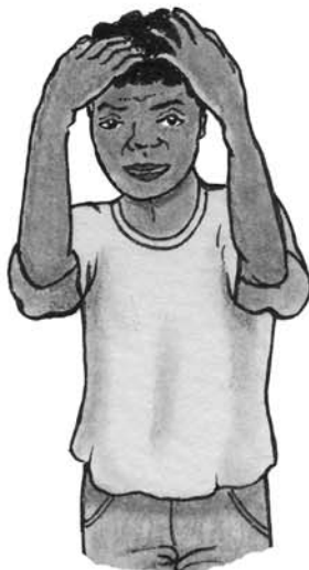
In your head