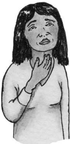
In your throat