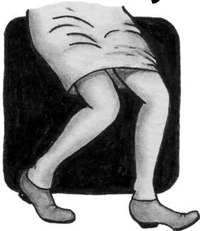
You want to run away