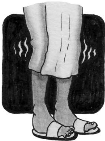
Your knees shake