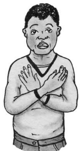
In your chest